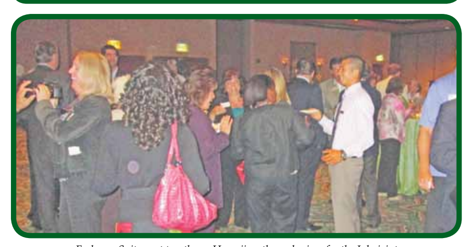
Embassy Suites put together a Hawaiian-themed mixer for the July joint mixer with Salinas Valley and Monterey Peninsula Chambers.